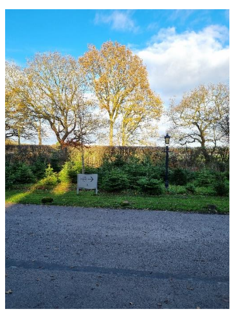
Figure 4 - Fire Assembly Point

We do not have a specific area to charge wheelchairs or batteries. However, we are happy for you to plug into the main sockets