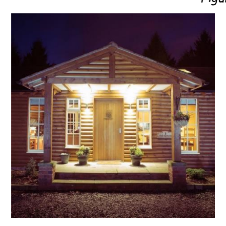
Figure 6 - How a lodge looks at night