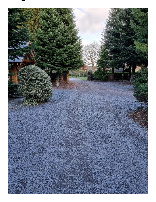
Figure 1 - Example of Parking Area