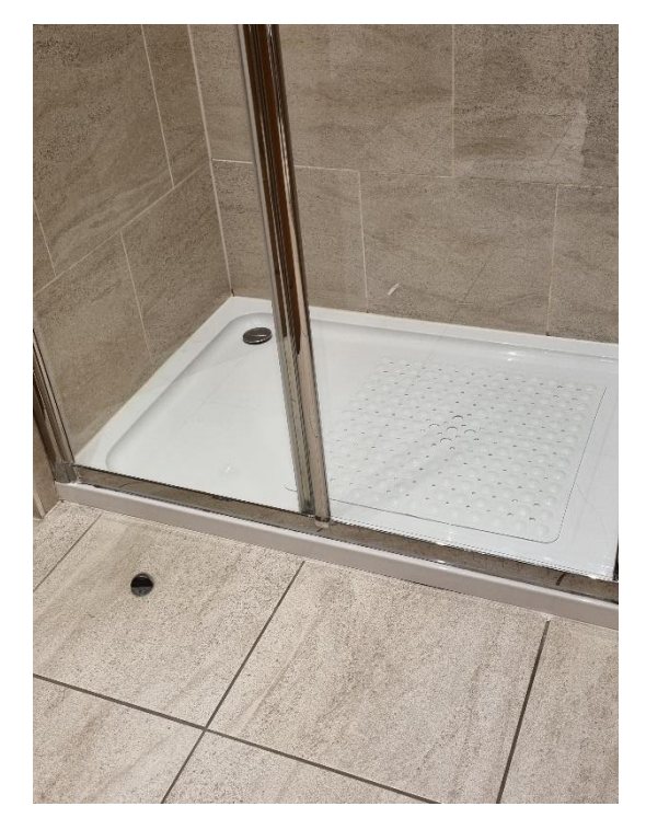
Figure 3 - Standards shower access level

• The toilets DO NOT have handrails. The direction of transfer onto the toilet is to the front. There is 400mm at the front of the toilet.