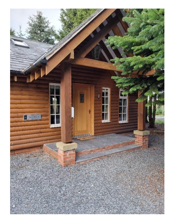
Figure 2 - Example of the front of all of our lodges