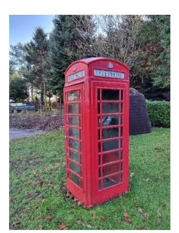
Figure 5 - Free Public Phone (Emergency Use)

Mobile phone reception is variable depending on your network. A phone is provided for emergency use at the entrance to the Log Cabins in an old Red Phone Box.